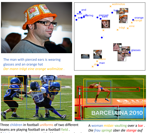
teams are playing football on a football field . Die frau : 3 kinder am sportplotz , zwei im blauen dress , einer im schwarz-weißen mit blauen schutzhelmen rangeln .

Figure 3: t-SNE visualization and grounding of the learned multilingual multimodal embeddings on Multi30K. Note the sentences are not translation pairs.