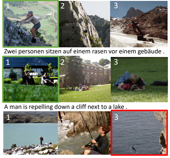
Figure 2: Qaulitative text-to-image matching results on Multi30K. Correct (colored in green) if ranked first.

The person in the striped shirt is mountain climbing .