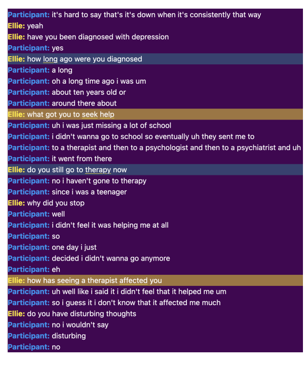
Figure 2: Illustrative segment from interview "381" in the evaluation set, highlighted in Figure 1. Conversation turns are color-coded based on the proportion of keywords present, with keywords underlined for emphasis.

health issues. Figure 2 shows one such segment. Here, we see the segment containing the only four questions that Ellie's model used to classify the participant, disregarding everything else in the conversation, including the question " Have you been diagnosed with depression? " Note that such questions may be asked to different participants, but an affirmative answer triggered Ellie to delve deeper into specific questions, questions that models could easily learned to identify and exploit to correctly classify the participants.